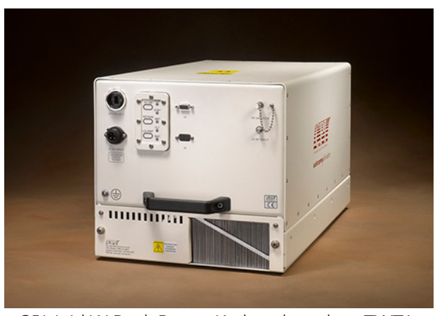
CPI 1.1 kW Peak Power Ku-band outdoor TWTA, Model TL12UO-A1-T

Modular design and built-in fault diagnostic capability via remote monitor and control.